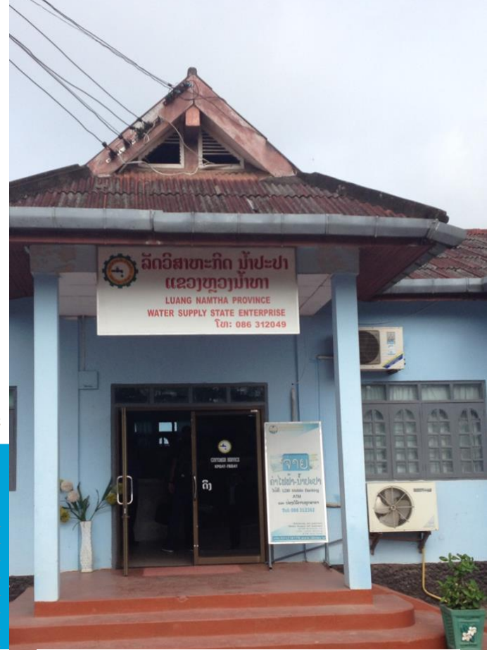
Laos, Luang Namtha: WOP