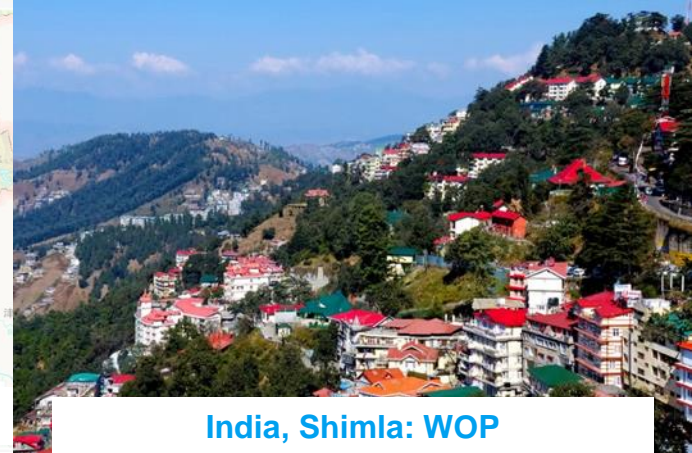
India, Shimla: WOP