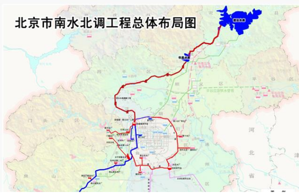
Beijing: artificial recharge